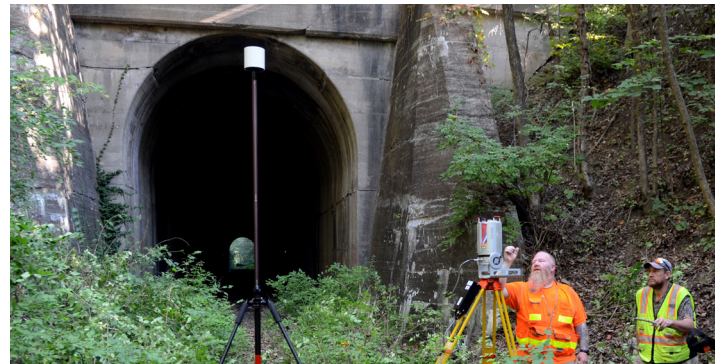
SURVEY CREWS SCAN THE VALE TUNNEL