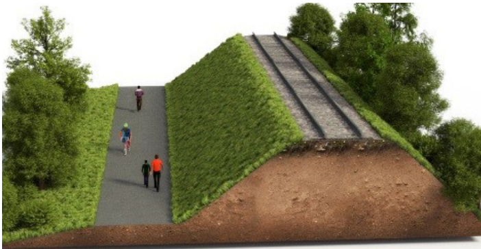
RENDERING OF A SHARED USE PATH ALONG A TYPICAL ROCK ISLAND ALIGNMENT