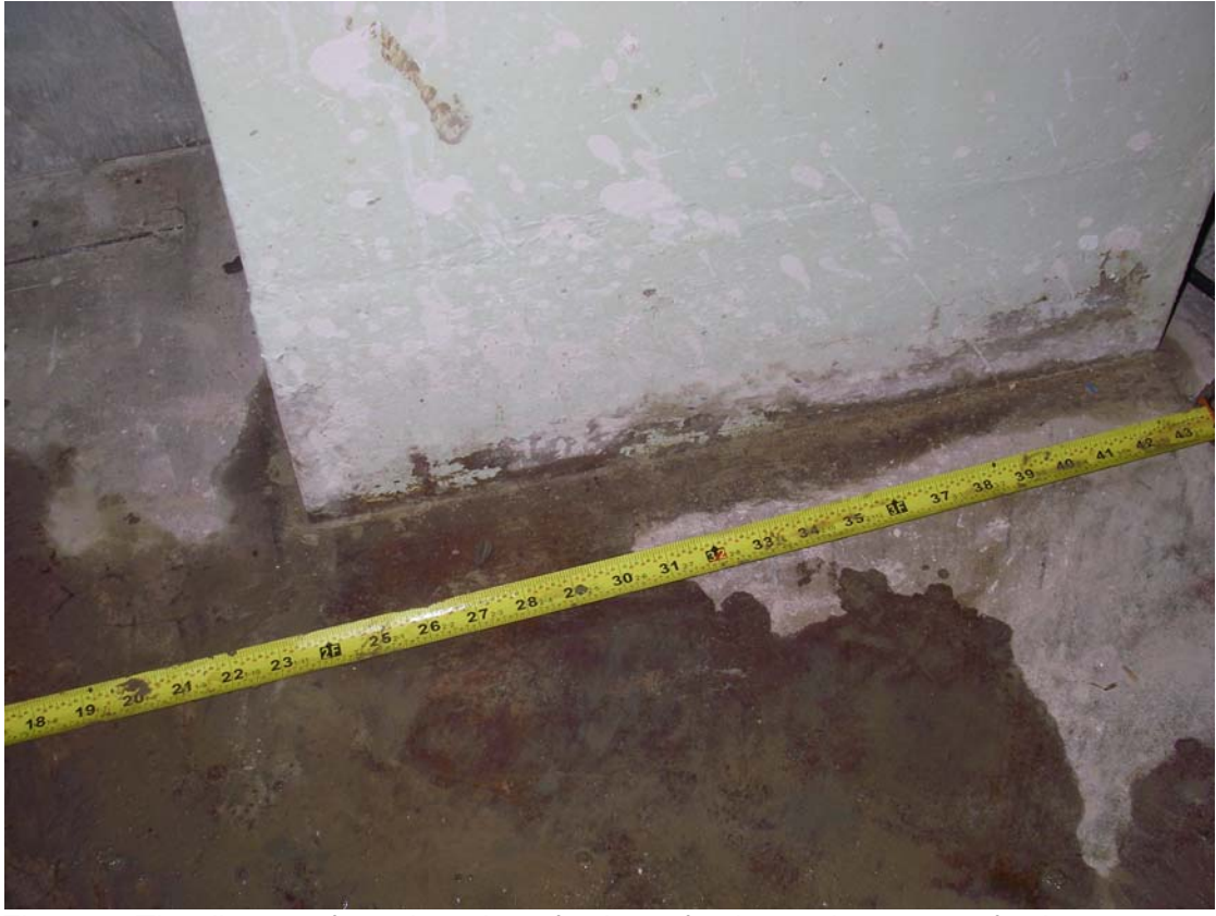
Figure 3: The distance from the edge of column footing to the center of column