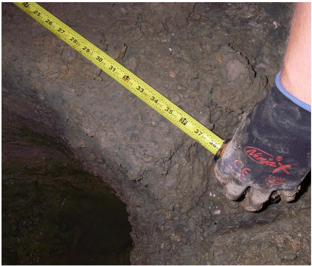
Figure 2: The dimension from center of column to edge of column footing