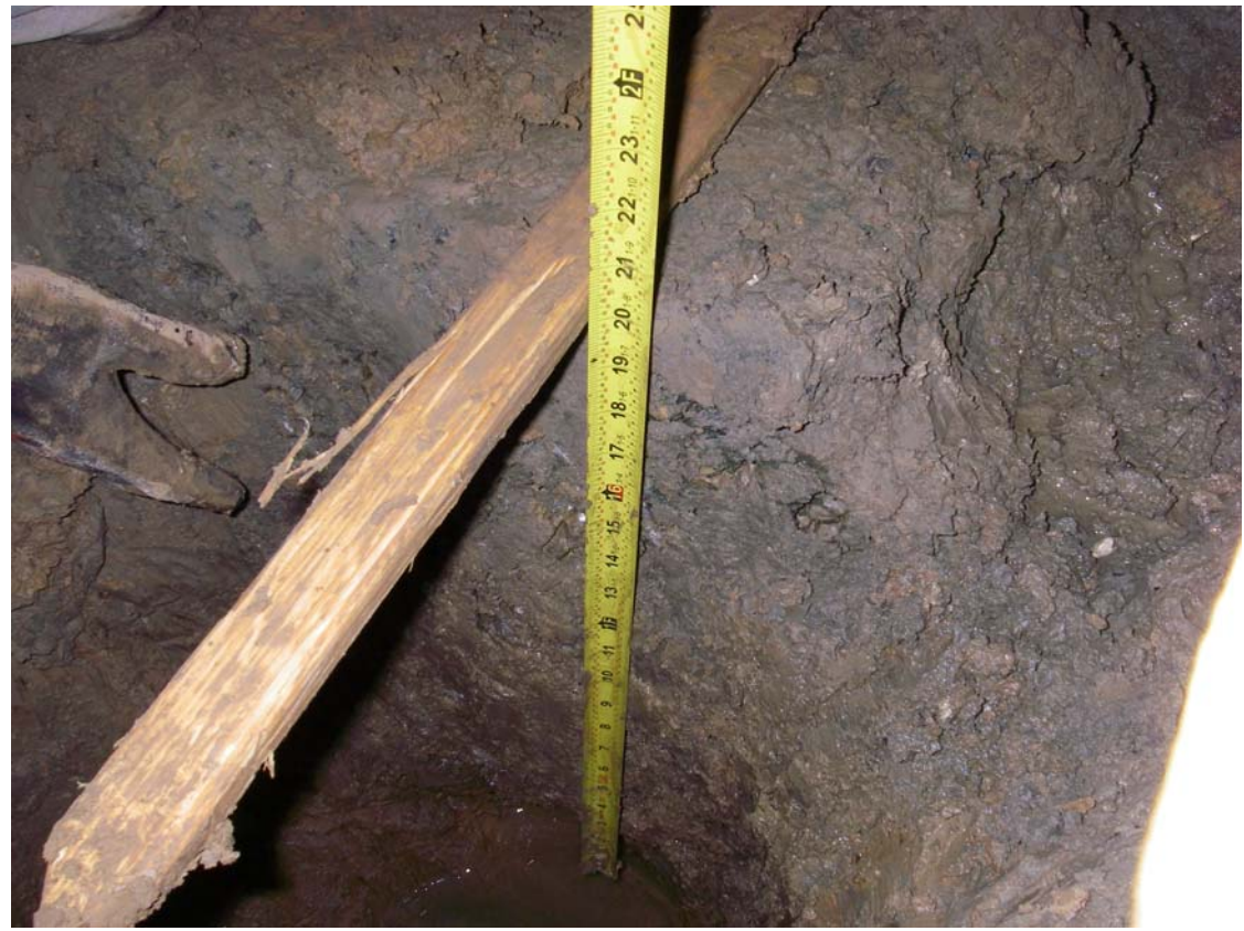
Figure 4: Depth to bottom of column footing