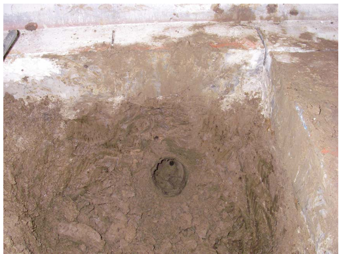
Figure 5: Excavation along the west edge (auger and tile probe holes seen above)

The area below the wall located just west of the elevator pit was excavated to document the conditions of what was expected to be supported on a strip footing. However, after excavating this area no strip footing was observed. A borehole was augered underneath the existing floor slab and a probe was used to push deeper into the augered borehole but yet no footing was observed (see Figure 5).