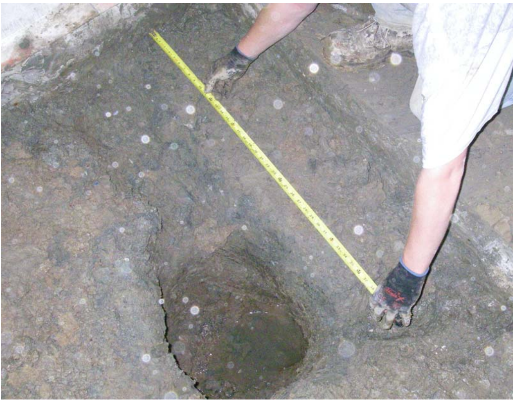
Figure 1: Measuring the exposed column footing for dimensions.