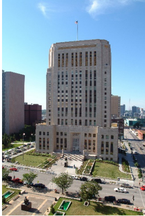
Jackson County Courthouse located in downtown Kansas City, MO.

Modern-day Jackson County was the site of the first military outpost in the Louisiana Territory. Fort Osage, which was built in 1808 under the direction of General William Clark, co-commander of the Lewis and Clark expedition.