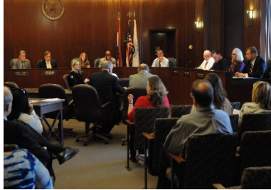
The County Legislature in session.

In 1970, the voters of the county adopted a Constitutional Home Rule Charter which established the Executive position and the County Legislature. Both the County Executive and the members of the County Legislature are elected by the voters to govern Jackson County. The Constitutional Home Rule Charter provides for a separation of the legislative and executive functions. The County Executive oversees the day-to-day operations of the county government and has the power to appoint administrative officers and directors to head up various departments, the power to veto legislation, and the responsibility to operate and effective, efficient County Government. The nine-member County Legislature is given broad legislative power. They introduce and enact all county resolutions and ordinances. Other elected county officials of Jackson County are the Sheriff and the Prosecutor.