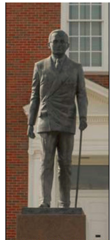
Statue of Harry S. Truman at the Historic Jackson County Truman Courthouse.

Jackson Countians then – as now – owe Truman much gratitude for his vision and successful execution of a multitude of decision that kept Jackson County at the forefront of forward-thinking county planning, civic up-building, good government, and welfare and healthcare issues. County Court minutes are full of details that tell the story of how Jackson County survived (and in some instances thrived) during the Great Depression of the 1930s.